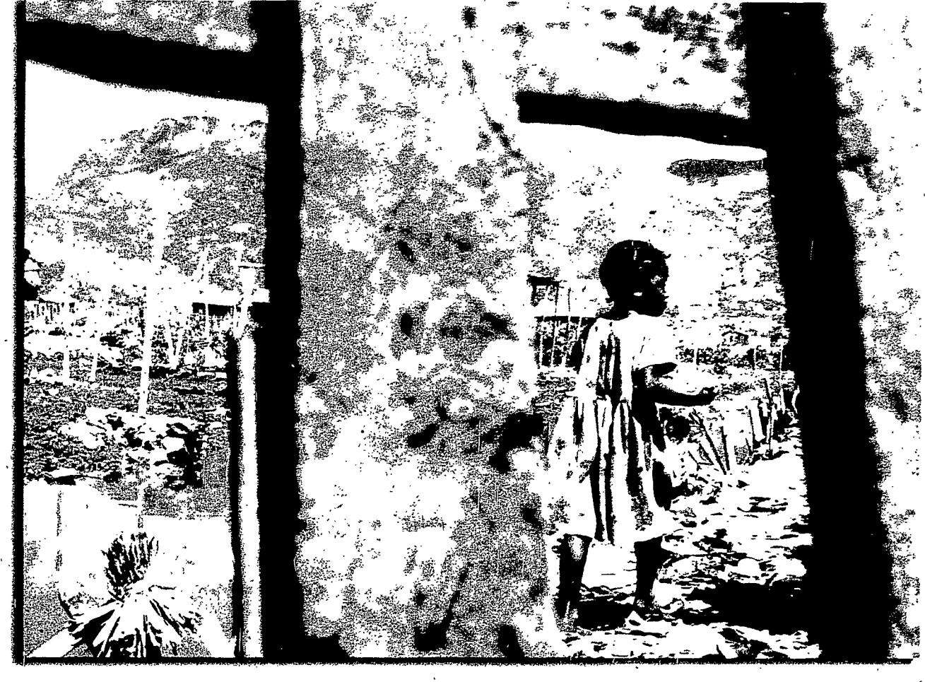
Living in houses that offer little protection from insects, rodents and the elements, children are more likely to develop skin diseases and other illnesses.

For only $2,000, you can build a home and help create a miracle for a desperate family. Once the home is completed, you will receive a picture of the family you've helped standing in front of their new home along with a certificate of appreciation.