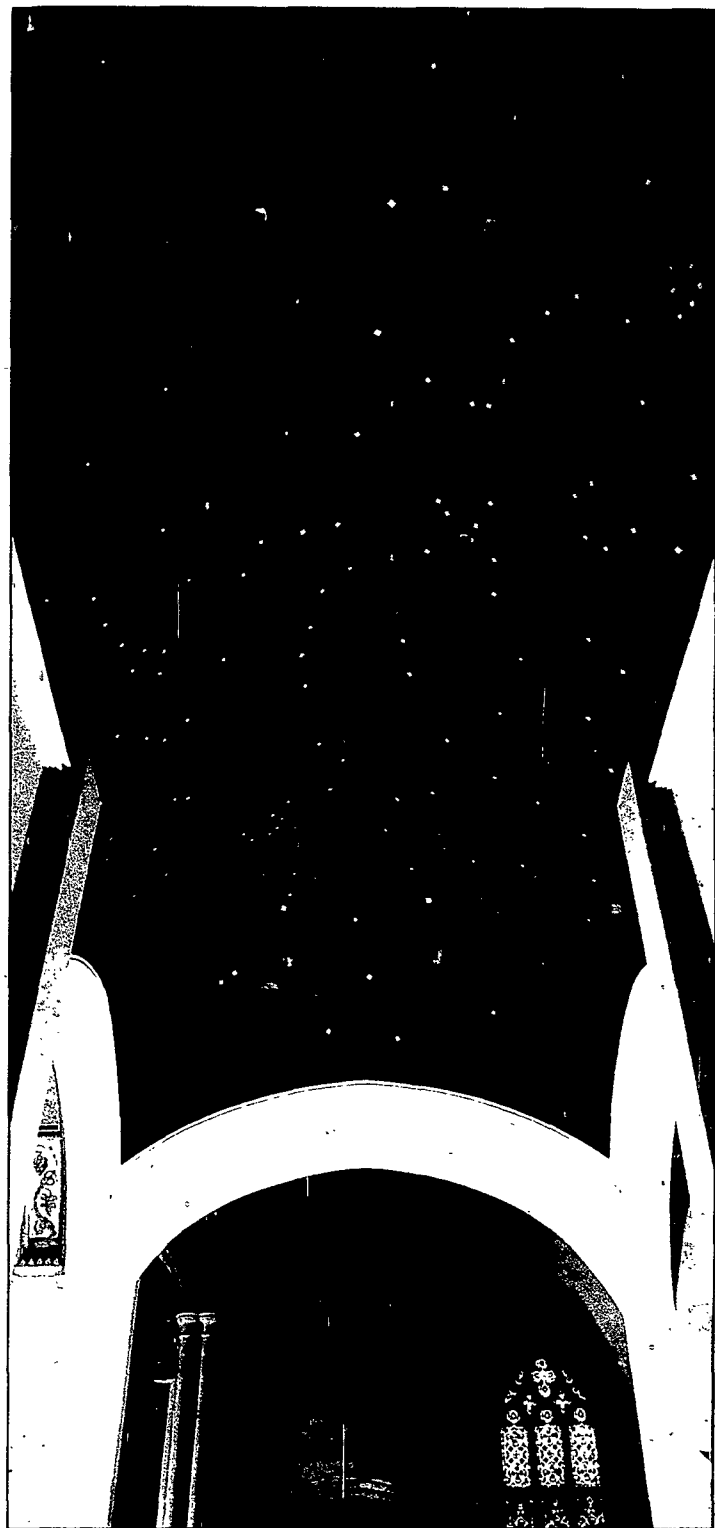
The ceiling of the new eucharistic chapel was painted as the night sky appeared on March 3, 1868, when the Vatican declared the establishment of the Diocese of Rochester.

ing the church on the shoulders of the saints.”