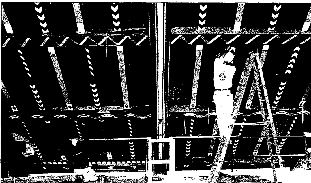
Painters for Conrad Schmitt Studios of New Berlin, Wis., use stencils to paint patterns on the cathedral's ceiling in April.

shaped church). On top of the rood beam — which in medieval churches was used to support a screen that separated the altar from the nave — stands the same crucifix that hung in the cathedral from the time it was built in 1927 until the time it was designated as the diocesan cathedral in 1957. The crucifix had been in storage for the past 47 years, Father Mulligan