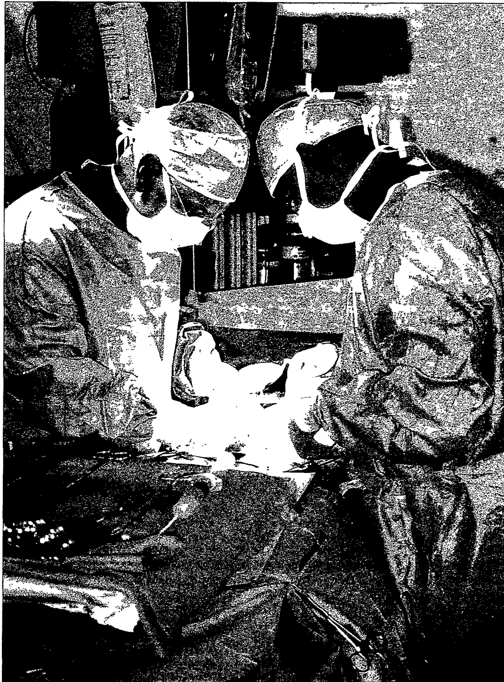
Environmental stewardship — especially finding safe methods for disposing of medical and other wastes — is the focus for organizations coming together under the banner of the Catholic Coalition for Children and a Safe Environment.

Story and photos by Catholic News Service