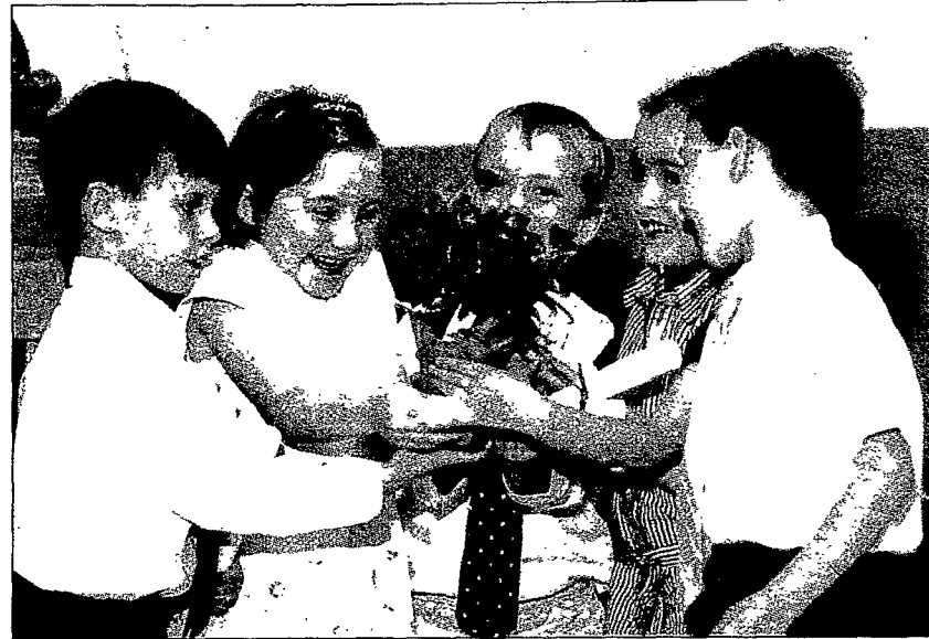
Rebecca Gosselin/Catholic Courier