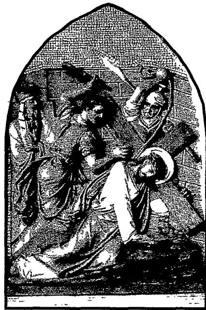
JESUS FALLS A SECOND TIME