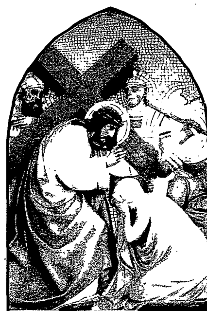
JESUS MEETS THE WOMEN OF JERUSALEM