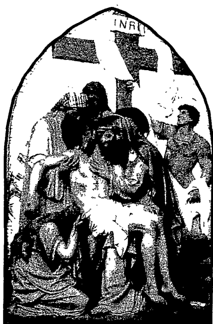
BODY OF JESUS IS TAKEN DOWN FROM THE CROSS