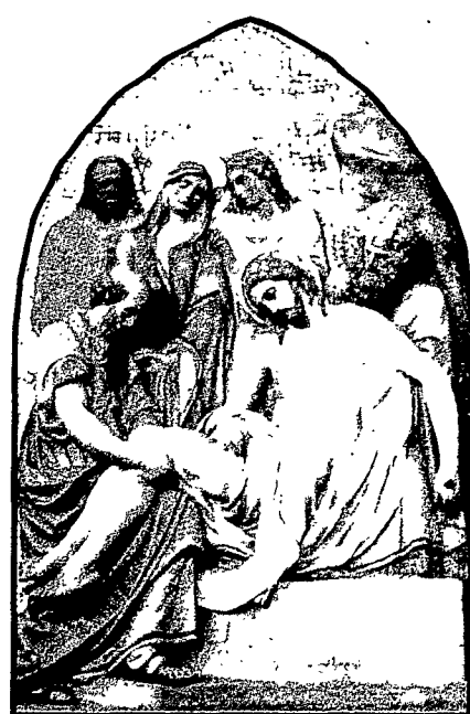
THE BODY OF JESUS IS LAID IN THE TOMB