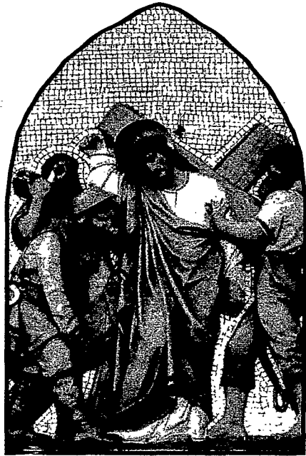
SIMON OF CYRENE CARRIES CROSS FOR JESUS