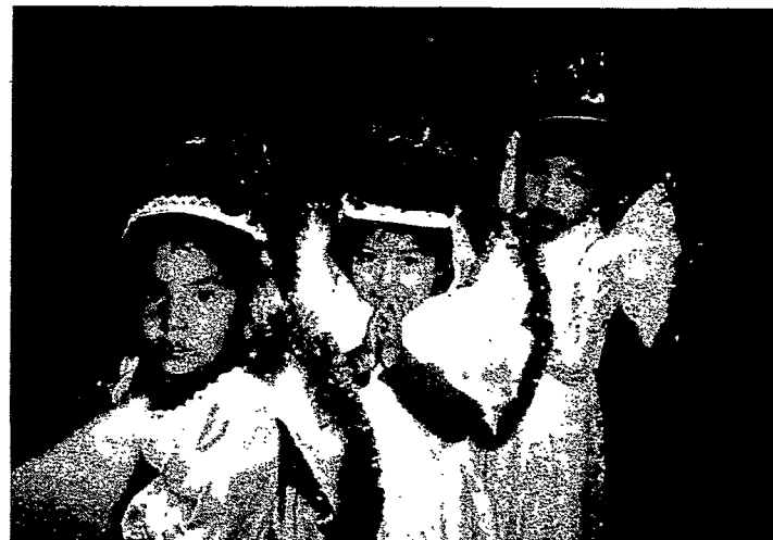
The shining eyes of these three Navajo "angels," part of last year's preschool pageant, reflect the hope of all at St. Bonaventure - to be able to meet the needs of children, families and the elderly for food, water, education and safe shelter from the severe winter. Please join us in this effort. Thank you.

Gifts made to St. Bonaventure Indian Mission and School are tax-deductible. The school also qualifies for "Matching Gifts."