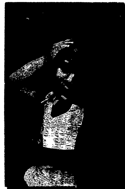
The children cry because of the hunger pains.