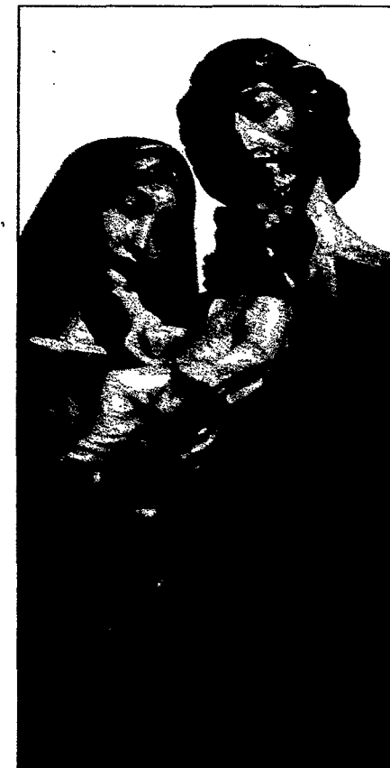
This new statue of the Holy Family graces one wall of the renovated church.