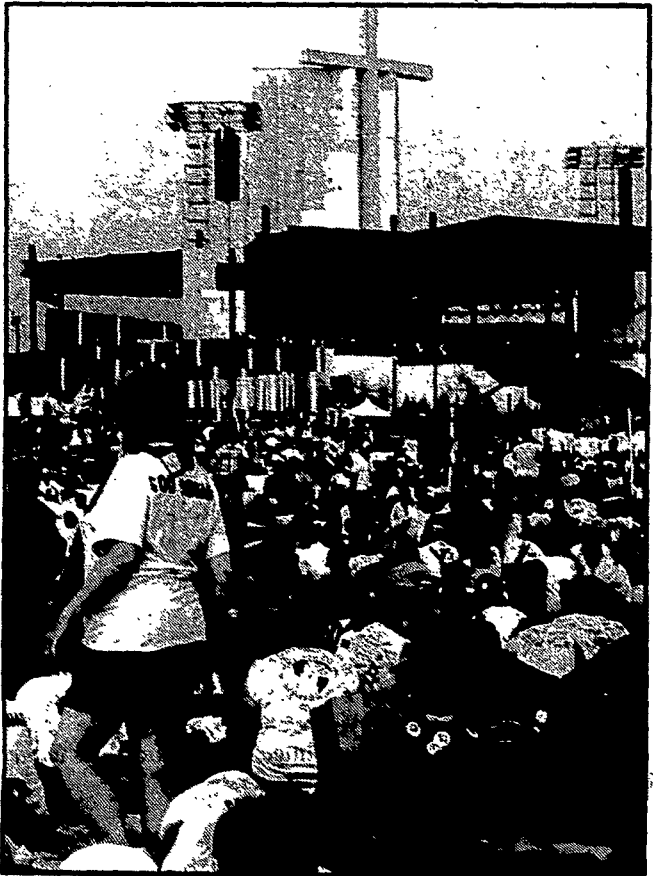
The crowd surrounds the stage at Downsview Park July 27.