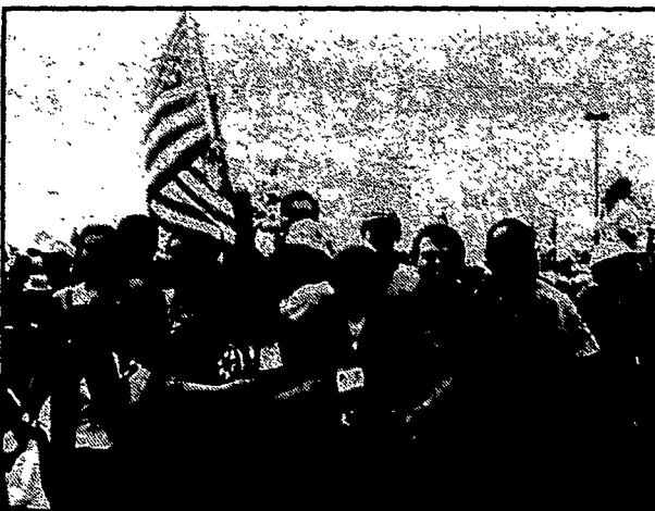
Diocesan pilgrims attend a welcoming ceremony.