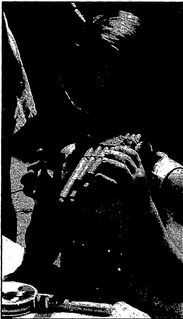
Five-year-old Bethany McHenry tries out a musical instrument during the 16th annual Canandaigua Arts Festival July 14. Booths lined Canandaigua's South Main Street for the festival, which featured more than 150 displays.