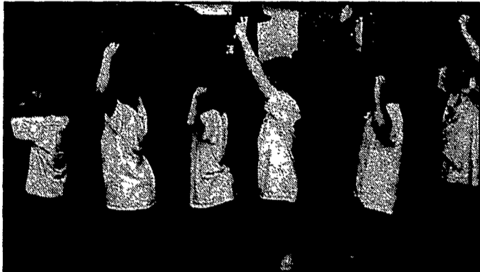
Fifth- and sixth-grade boys from St. Mary's create a dance of their own.