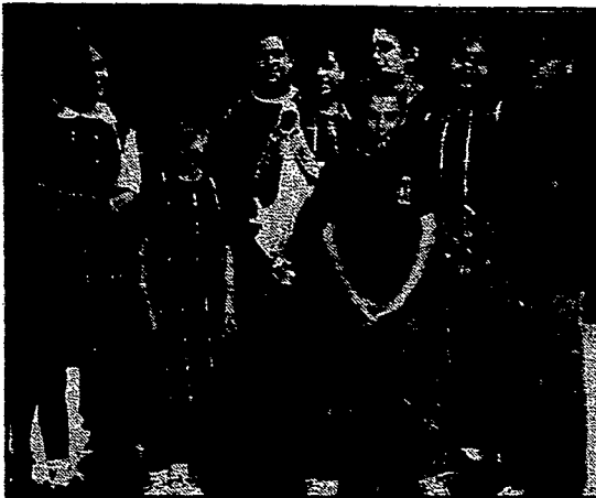
Some of the student gardeners pose with a statue of Mary after the service.