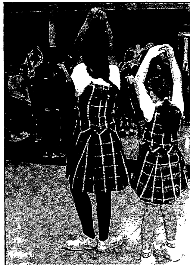
During the dedication service, children sing songs about peace, patriotism and Mary.