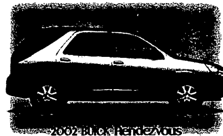
2002 BUICK Rendezvous