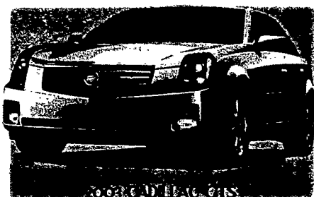
2003 CADILLAC CTS