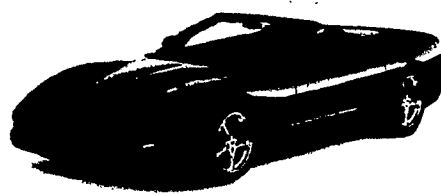
2002 CHEVROLET Corvette