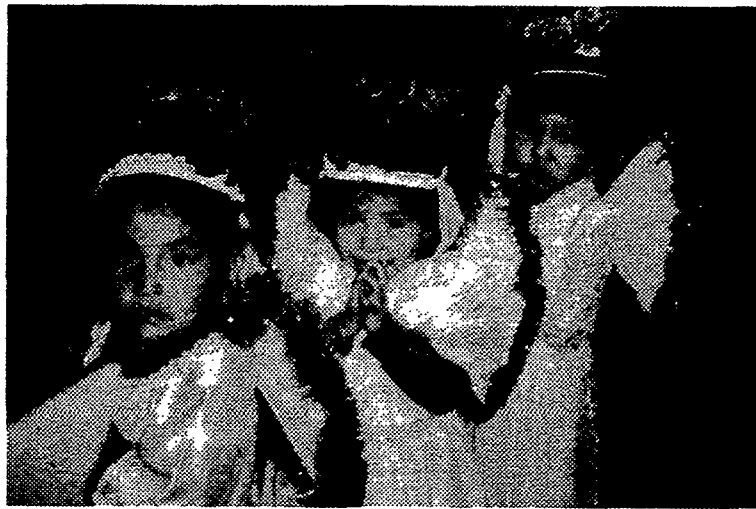
The shining eyes of these Navajo "angels" reflect the hope of all at St. Bonaventure - to keep the school open ... to give 250 children the skills they will need to break the cycle of poverty and to live a Spirit-filled life.

Will you help? Gifts made to St. Bonaventure Indian Mission and School are tax-deductible. The school also qualifies for "Matching Gifts."