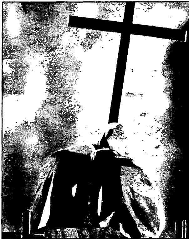
Pope John Paul II leans against a cross during the Way of the Cross at Rome's Colosseum on Good Friday, April 13. He walked the last three stations.

3. On that tragic Friday of the passion, which saw the Son of Man become "obedient unto death, even death on a cross" (Phil 2:8), the earthly phase of the Redeemer's life came to a close. Now dead, he was hurriedly placed in the tomb, at the setting of the sun. A singular sunset! The ominous darkness of that hour signaled the end of the "first act" of creation, convulsed by sin. It seemed like the victory of death, the triumph of evil. Instead, while the tomb lay in cold silence, the plan of salvation was approaching its fulfillment, and the "new creation" was about to begin. Made obedient by love even to the extreme sacrifice, Jesus Christ