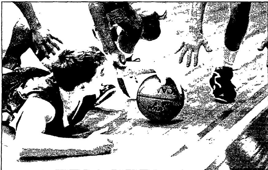
McQuaid player dives on the floor for the ball during a turnover at the McQuaid/Franklin game.