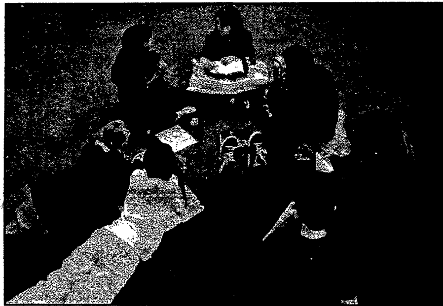
Attendees break into smaller groups to discuss love.