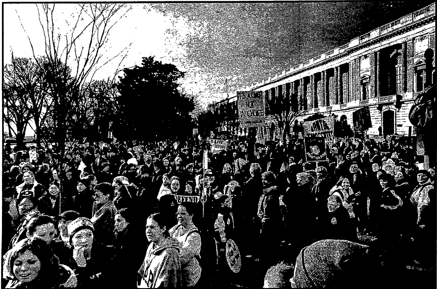
Thousands of pro-life marchers from all over the United States head toward the Supreme Court building in Washington, D.C., Jan. 22 in protest of the Roe vs. Wade decision of 1973.