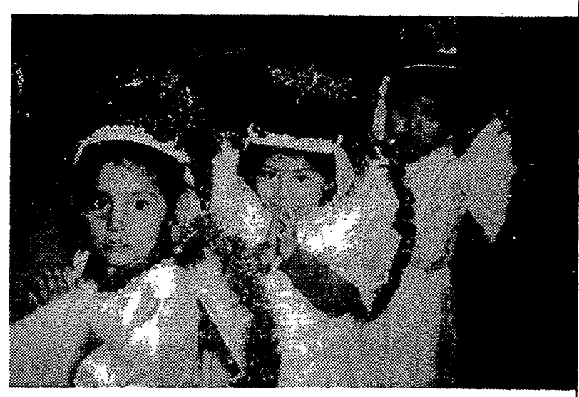
The shining eyes of these Navajo "angels" reflect the hope of all at St. Bonaventure - to keep the school open ... to give 300 children the skills they will need to break the cycle of poverty and to live a Spirit-filled life.

Gifts made Indian St. Bonaventure Mission and School are taxdeductible. The school also qualifies for "Matching Gifts."