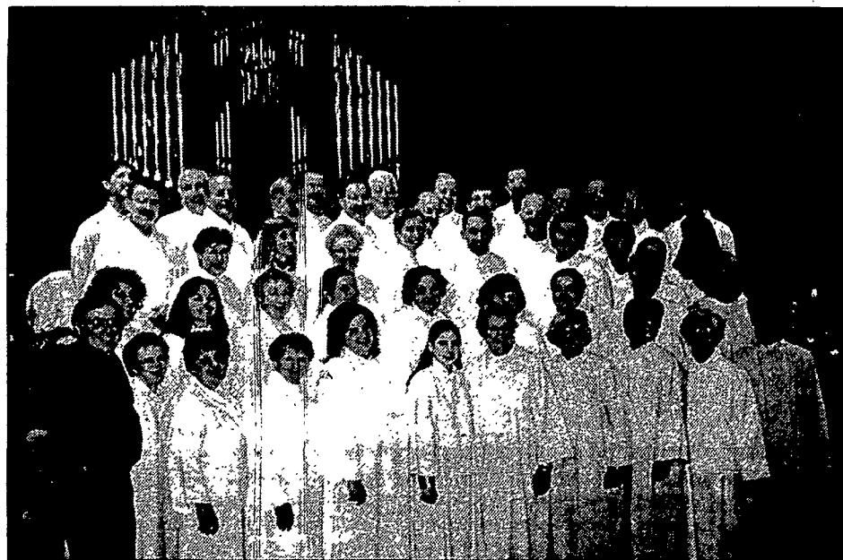
The combined choirs of St. Louis Church, Pittsford, and St. Catherine of Siena Church, Mendon, are slated to sing at a papal Mass in Rome this fall.