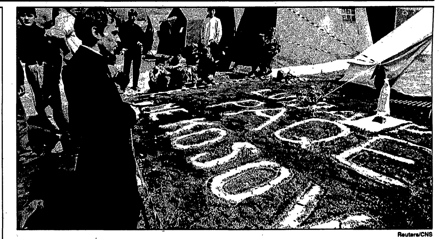
A Catholic priest prays in front of a makeshift shrine that reads, "Pray for peace in Kosovo," at a camp for Kosovar refugees in Kukes, Albania, in April.

The Catholic Courier wishes to provide space for readers throughout the diocese to express opinions on all sides of the issues. We welcome original, signed letters about current issues affecting church life. Although we cannot publish every letter we receive, we seek, insofar as possible, to provide a balanced representation of expressed opinions and a variety of reflections on life in the church. We will choose letters for publication based on likely reader interest, timeliness and a sense of fair play. Our discerning readers may determine whether to agree or disagree with the letter writers' opinions. Letters must not exceed 500 words. Anonymous letters and the use of pseudonyms are unacceptable. We reserve the right to edit letters for legal and other concerns. With respect to errors in submitted text, we will correct spelling only. Mail letters to: Catholic Courier, P.O. Box 24379, Rochester, N.Y. 14624. Please include your full name, phone number and complete address for purposes of verification.