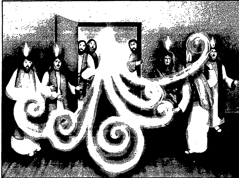
Illustration by Linda Jeanne Rivers

"What does it mean?" someone asked. "It is a miracle!"