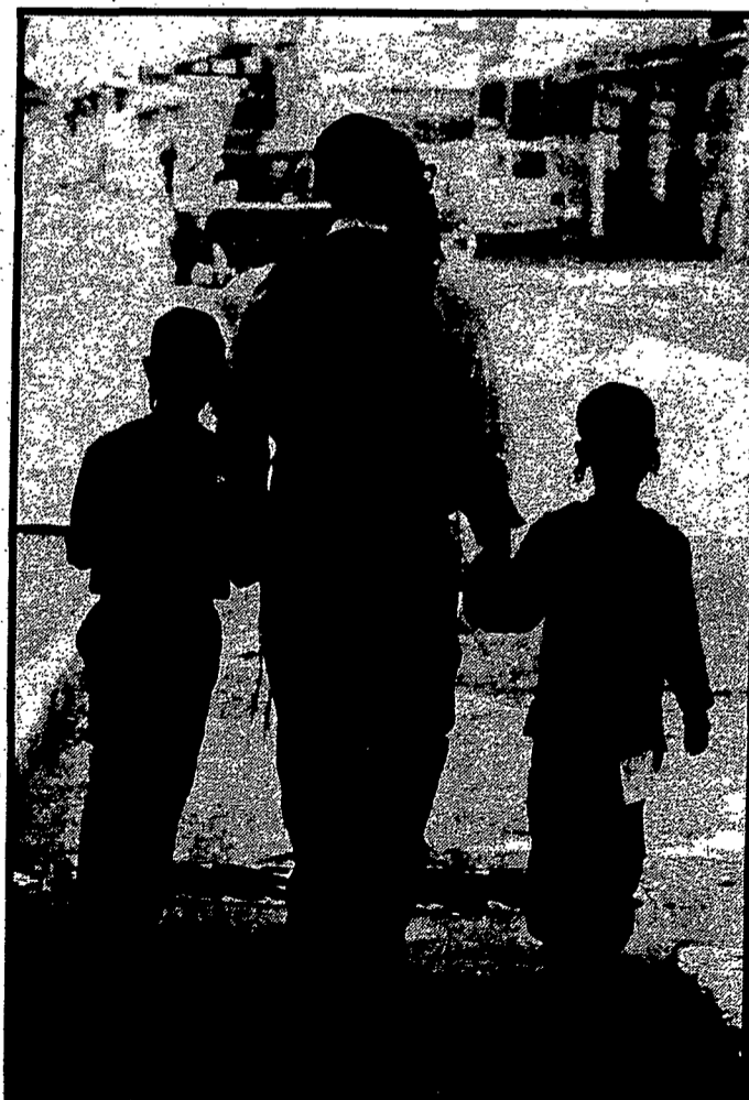
A Jew walks with his sons in Jerusalem's ultra-orthodox neighborhood of Me'a She'arim, Aug. 7.