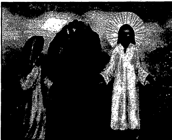
able to believe it was Jesus."

"Unless I see him for myself and see his wounds," he said, "I just will not be