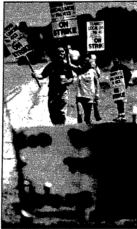
CNS United Parcel Service striking employees picket at the main entrance of the Columbus, Ohio, UPS facility Aug. 7.

Of the 308,000 UPS employees, 185,000 are represented by the Teamsters. About