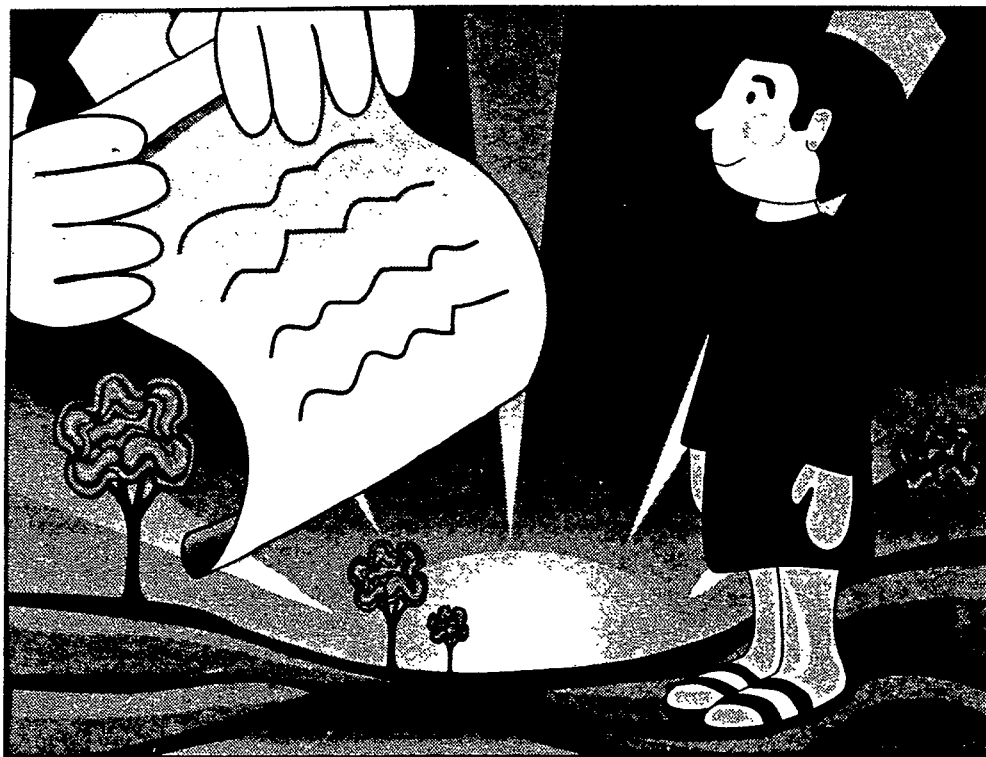
Illustration by Zoe Maves

"Ezekiel, you are a man, a mortal. But I am your God. Have no fear of the people. They will hate you, laugh at you, avoid you. Sometimes their words will feel like the sting of a scorpion. But I will always be with you."