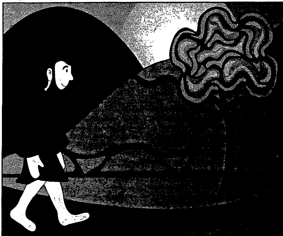
Illustration by Zoe Woodruff

At the rising of the next day's sun, Moses ordered the building of an altar to the Lord. A sacrifice was offered and Moses read from the new book of commandments.