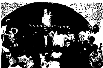
Children from a distant town visit Don Bosco Moshi Seminary