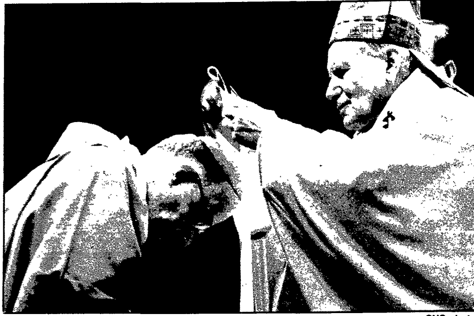
Pope John Paul II places a white pallium on Portland Archbishop Francis E. George in June 1996. Archbishop George was named the archbishop of Chicago April 8. He succeeds Cardinal Joseph Bernardin who died last November.

chosen an individual who will — through his spiritual leadership and his personal example — guide our local church well as we face the challenges and opportunities of a new millennium of Christianity," he said in a statement.