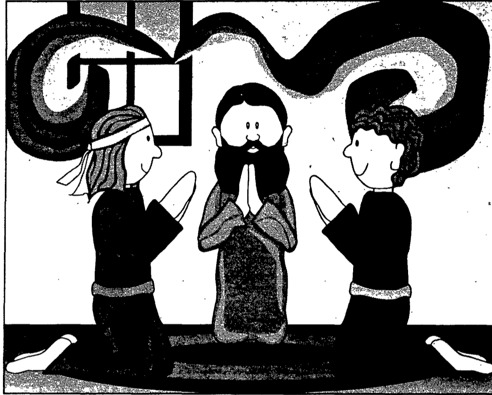
Illustration by Zoe Woodruff

temple every day with each other and for each other. If one family needed money or supplies, another would sell one of their possessions and give the money to the family in need. At night they would eat meals at home, thankful for all the things God had done for them.