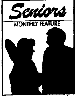
Seniors MONTHLY FEATURE

Learning assistant at one school. Aide at another school. Hospital receptionist. Community volunteer.