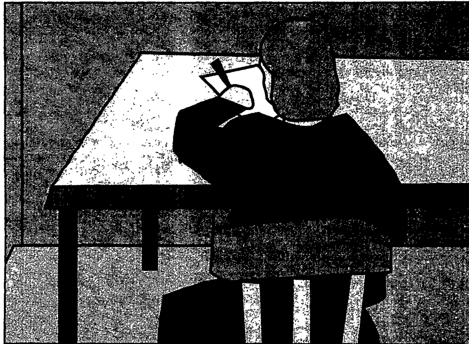
Illustration by Amy Sundstrom

Live your life according to the example Jesus set for us. God's greatest wish is for