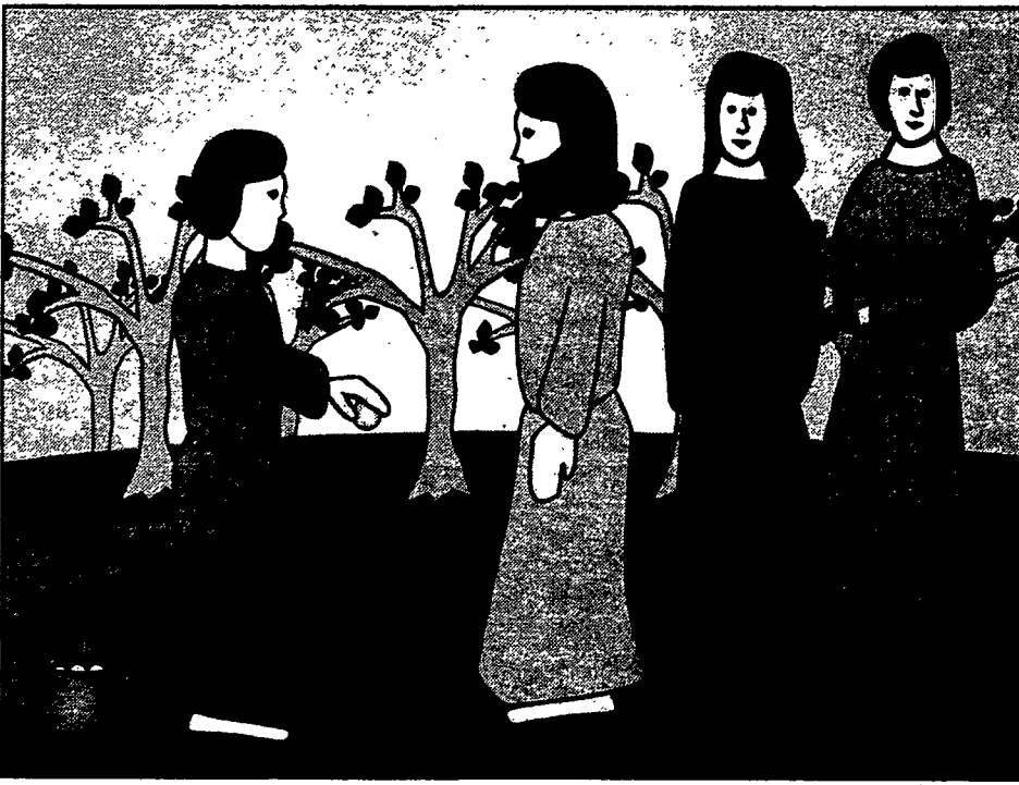
Illustration by Amy Sundstrom

"At 9 o'clock the landlord returned to the village and found a few more men who were not working for