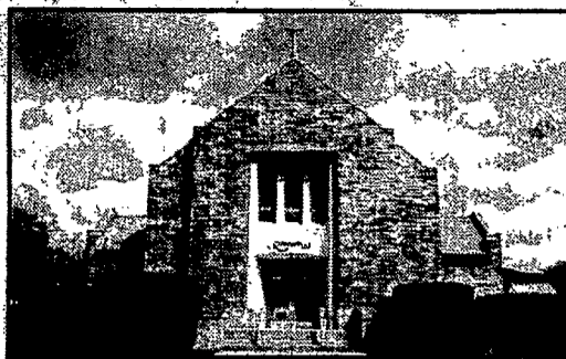
St. Vincent DePaul Church