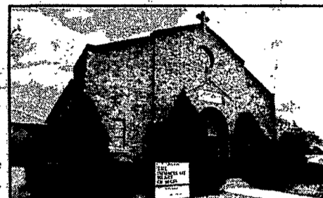
Immaculate Heart of Mary Church