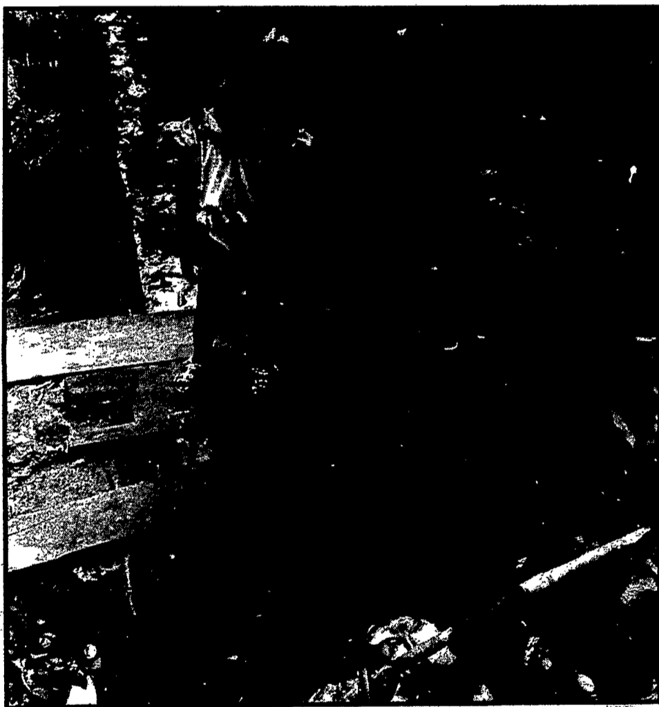
Above: In a recent letter to Food For The Poor's founder, General Colin Powell commended the ministry for its work among the poor.

At left: Children are the most tragic victims of poverty in the Caribbean. Imagine your own children or grandchildren living in this dangerous world of garbage, decaying buildings and open sewers.