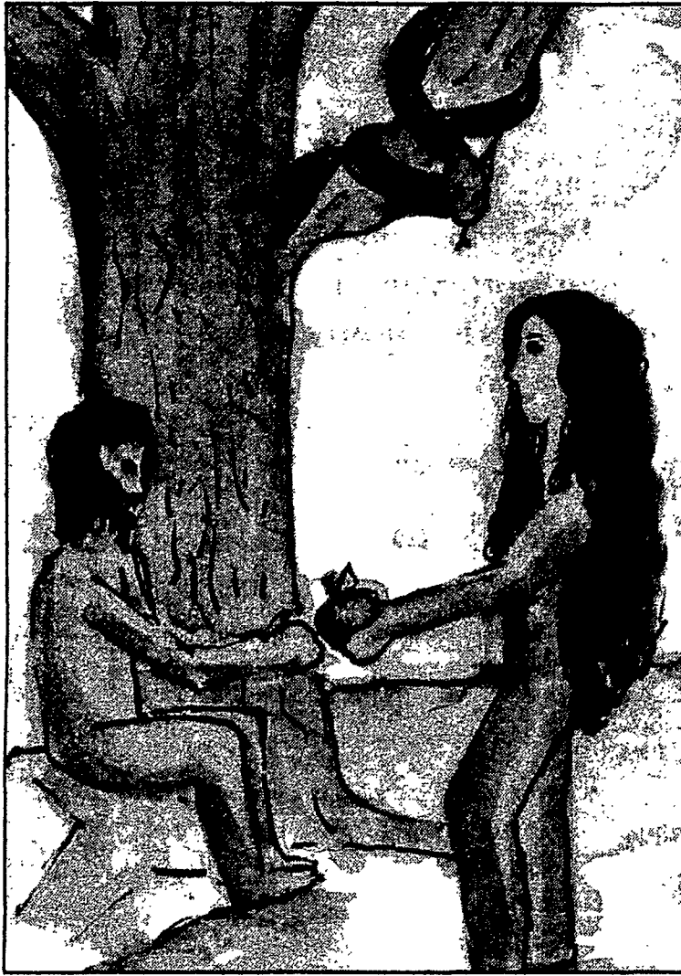
Illustration by Amy Sundstrom

One of the creatures God had made was the snake. The snake was very crafty and devious. When the woman was alone, the snake said to her, "Is it true God will let you eat the fruit of the tree of knowl-