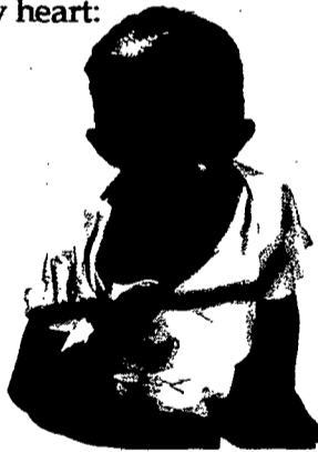
Home for Abandoned Children, Bangladesh

Lord, help me prepare for your coming by holding your mission-poor in my heart: ...the tiny child, abandoned, bravely sitting in his crib, holding back tears ...the grandmother, in the midst of war, waiting, waiting, in a camp for the homeless ...the young family with none of this world's goods, searching for the treasure we call faith.