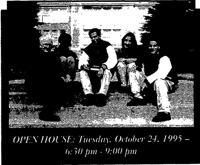
OPEN HOUSE: Tuesday, October 24, 1995 - 6:30 pm - 9:00 pm