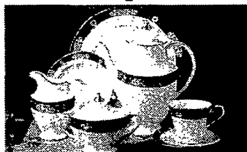
We ship anywhere. 800 number available

Offering the finest lines of: China, Crystal, Sterling Silver, Table Linens, Casual Dining, Pottery, Cookware and Flatware. Attendants Gift, Free Gift to the Bride.