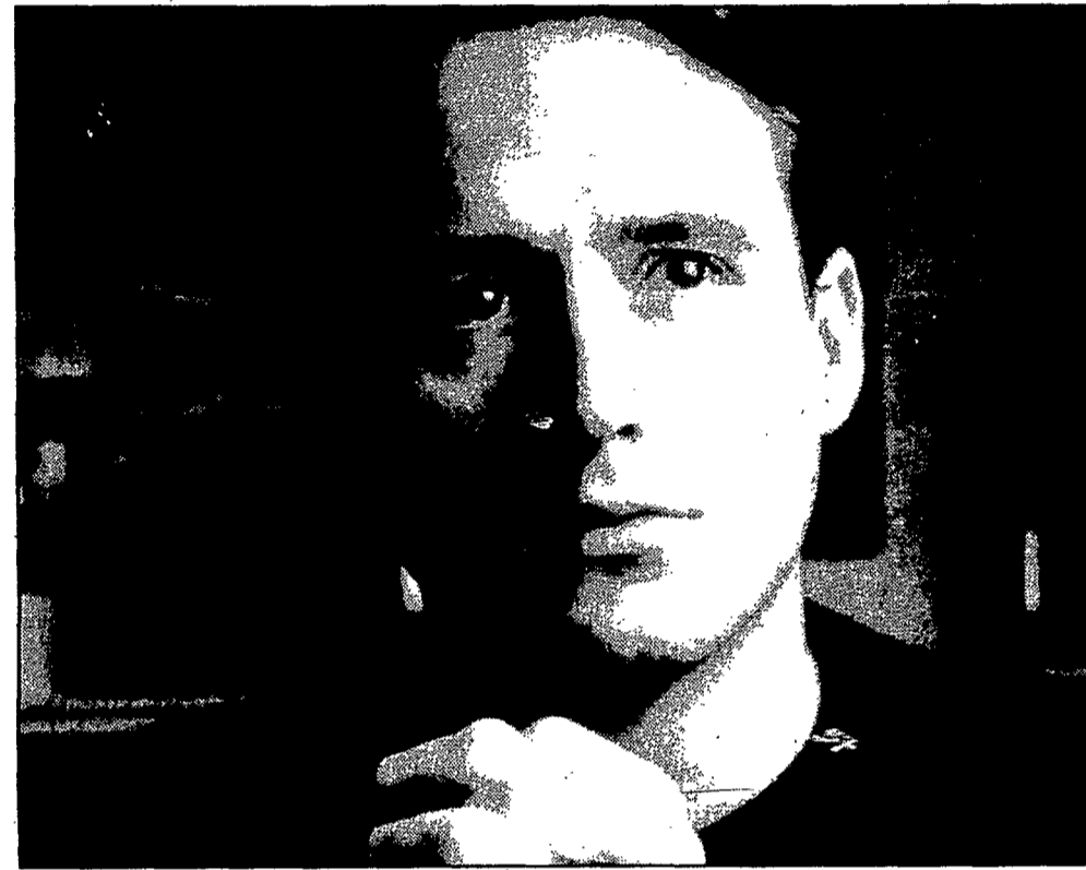
Linus Roache in Antonia Bird's 'Priest.'

EDITORS' NOTE: This letter has been edited to comply with space limitations.