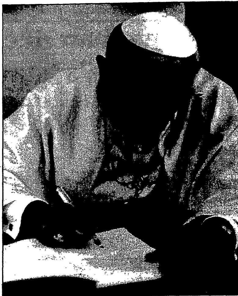
At the Vatican May 29, Pope John Paul II puts his signature on his latest encyclical, 'Ut Unum Sint' ('That They May Be One').

True Christian unity must include a common understanding of the profession of faith and the sacraments as well as bonds of communion between members of the hierarchy, he said.