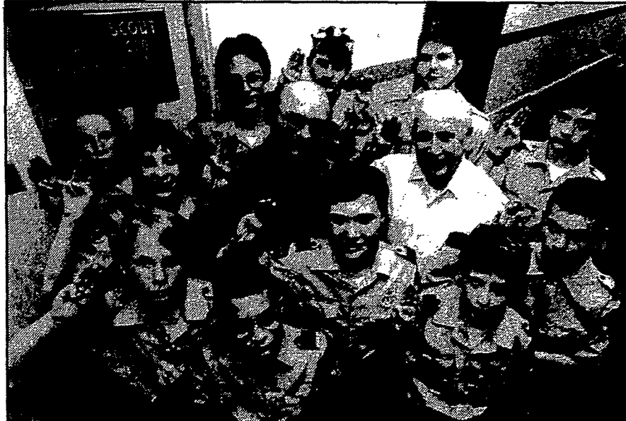
Members of Crusader Troop 200 gathered for a 1992 meeting in the basement of Rochester's St. Boniface School.

In 1917, the U.S. bishops formed the National Catholic War Council, a precursor of today's National Conference of Catholic Bishops. One area that concerned the bishops at