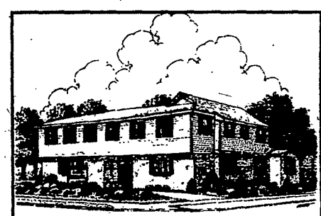
2692 Dewey Ave.