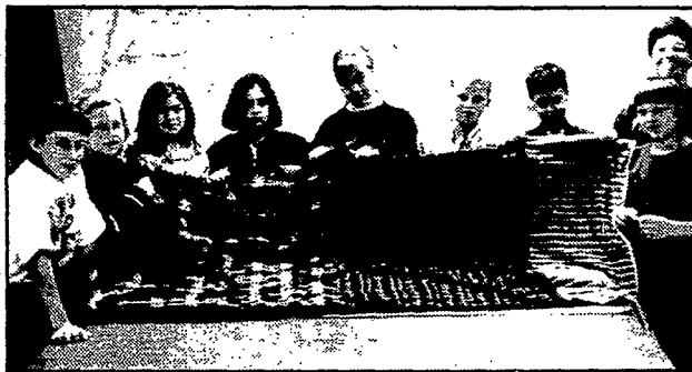
Holy Cross sixth-graders display the quilt they assembled for a Tompkins County ecumenical group.