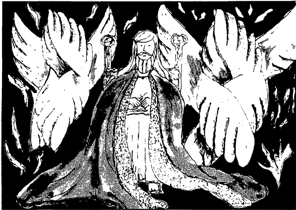
Illustration by Kathy Welsh