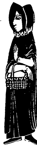
St. Elizabeth Ann Seton

Elizabeth Ann Seton was the first person born in the United States to be named a saint. She was born in New York City two years before the signing of the Declaration of Independence. Although not a Catholic by birth, she became a convert shortly after the turn of the nineteenth century. She established a school for girls in Baltimore and founded a new religious order to staff it. She called the order The Sisters of Charity, after the order of Saint Vincent De Paul. We remember Elizabeth on January 4.