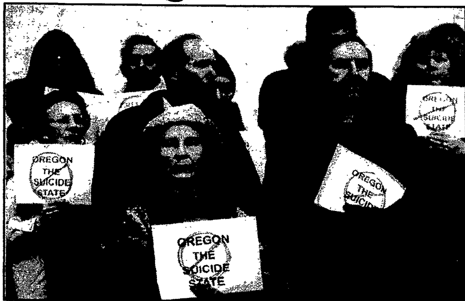
Protesters Dec. 8 hold signs on the Capitol steps in Salem, Oregon, as members of Oregon Nurses for Life and Health protest assisted suicide. Measure 16, which passed by a narrow margin in last November's election and would have gone into effect Dec. 8, was put on hold after a federal judge granted a temporary restraining order blocking the law until at least Dec. 18.