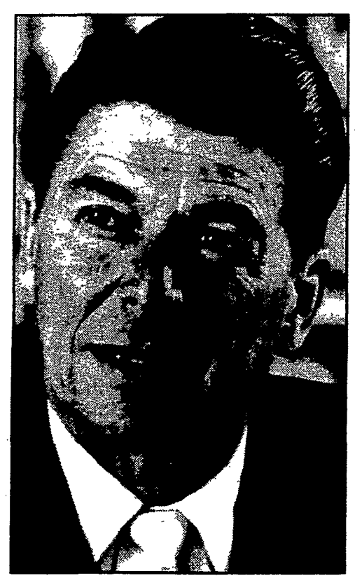
File photo Ronald Reagan was recently diagnosed with Alzheimer's disease.

The organization also offers seminars, workshops and information sessions. Nemeroff said. On Nov. 30, for example, the agency is sponsoring a workshop titled, "Hints for Happier Holidays," at the Park Ridge Education Center on Long Pond Road in Greece. The program, which will run from 1:30-3:30 p.m., will offer ways to modify traditions and simplify holiday celebrations to ac-