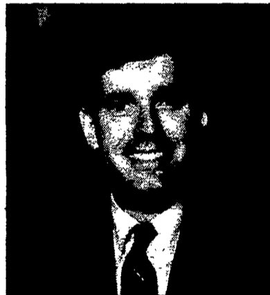
27th Cong. Dist. *Bill Paxon (R/C/RTL)