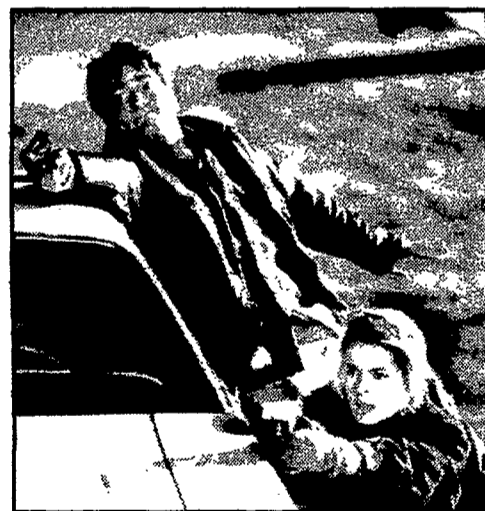
Buena Vista Pictures

(Warner Bros.) Derivative melodrama in which a mobster (Armand Assante) on trial for murder has a corrupt ex-cop (William Hurt) intimidate a juror (Joanne Whalley-Kilmer) by threatening the life of her child unless she votes to acquit him. As directed by Heywood Gould, the narrative steadily disintegrates into a cliché-ridden gangster movie as the frightened woman cooperates, then resorts to murder in order to guarantee her family's continued safety. Intermittent violence, some sexual innuendo and occasional rough language. The USCC classification is A-III — adults. The MPAA rating is R — restricted.